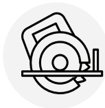
Router, Track Or Circular Saw (Fine-Toothed For A Smooth Finish)