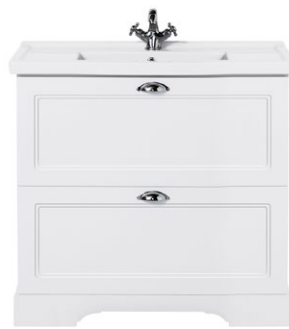
2 Drawer Floor Standing Vanity, Matt White ^ Widths · 600, 700, 810, 1000 · H892 x D485 mm