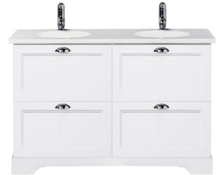
4 Drawer Floor Standing Vanity, White Kordura Top with Inset Bowls, Matt White ^* Widths · 1130, 1350, 1550 · H875 x D500 mm