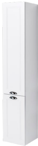
2 Door Wall-Hung Cabinet, Matt White ^ Width · 300 x H 1695 x D 290 mm