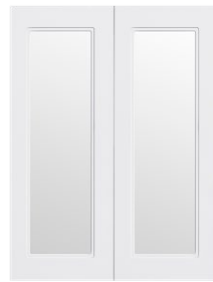
2 Door Wall-Hung Mirror Cabinet, Matt White ^ Widths · 565, 675, 775, 965 · H750 x D120 mm