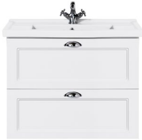
2 Drawer Wall-Hung Vanity, Matt White ^ Widths · 600, 700, 810, 1000 · H625 x D485 mm