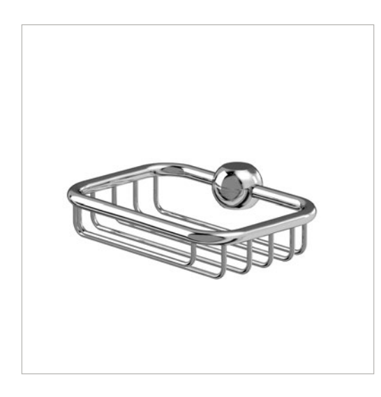
PRODUCT CODE V23